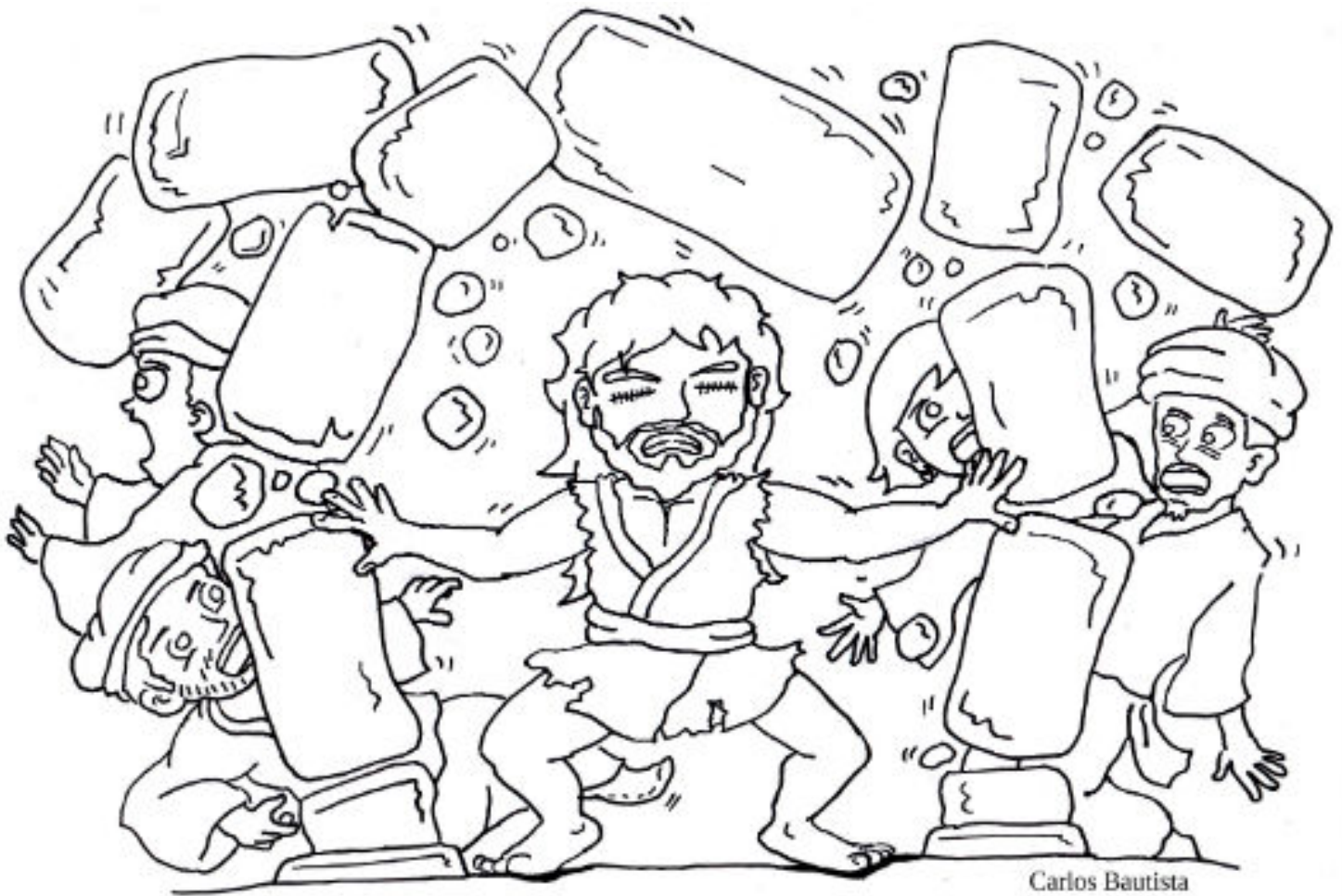
Carlos Bautista ministry-to-children.com

Instructions: connect the dots and color the picture.